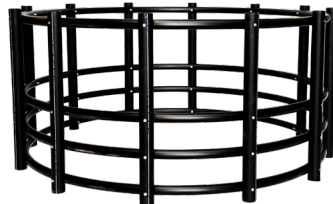
8' x 46" Big Country Hay Feeder