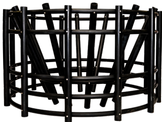
8' x 56" Cone Feeder