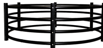
8' x 32" Horse Feeder