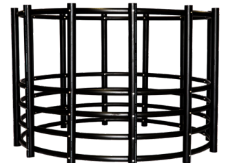
8' x 66" Bull Feeder