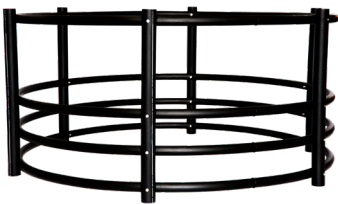
8' x 46" Original Hay Feeder