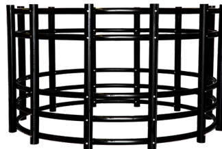
8' x 56" Big Country Hay Feeder