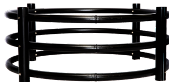
5' x 24" Small Animal Hay Feeder