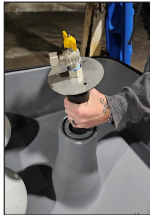
Step 5: Attach valve to cone