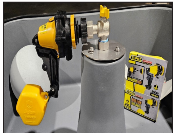
Step 7: Attach float to valve